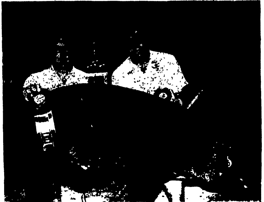
Kerry Boyd (right), Ephrata R1, exhibited the grand champion market hog during the 4-H show held Tuesday at the Lancaster Stockyards. Ezra Good, representing Hatfield Packing Co. bought the hog for $1.16 per pound.

The sale grossed over $19,000 with 136 hogs selling for an average of 66.6 cents per pound.