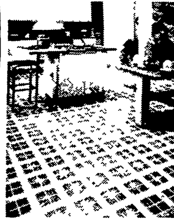
Vinyl floor resembles painted tile.

Easy Living Today's lifestyle may be summed up as comfortable. Any decorative look that makes everyone feel right at home is fitting for the times. The predominant decorative look that encompasses this free and easy living is "country."