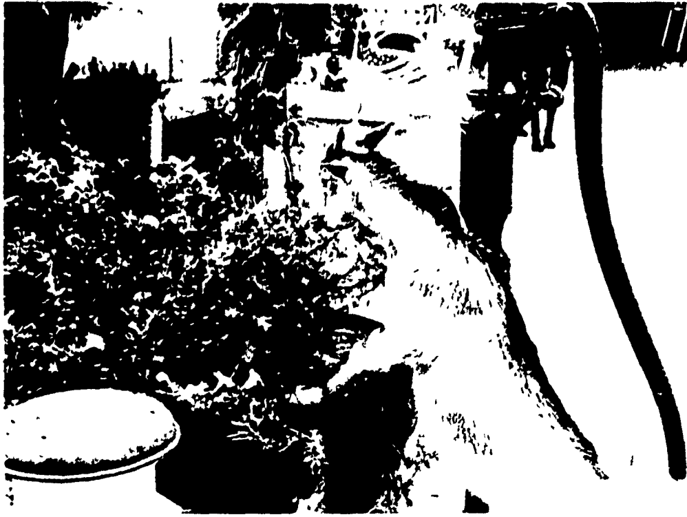
Living up to his name, Troubles the goat takes a nibble from a blooming geranium plant. A pygmy goat, Troubles stands about 18 inches high and is a favorite at the Funck's farm.