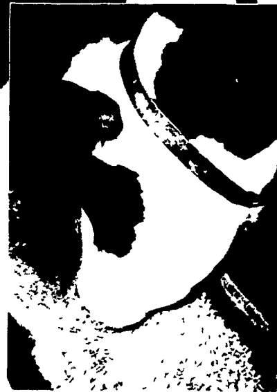
Only four pounds of Wayne Conditioning Ration per day helps the dry cow rebuild her body and develop a healthy calf.

USE WAYNE ANIMAL HEALTH AIDS TO KEEP YOUR LIVESTOCK AND POULTRY HEALTHY