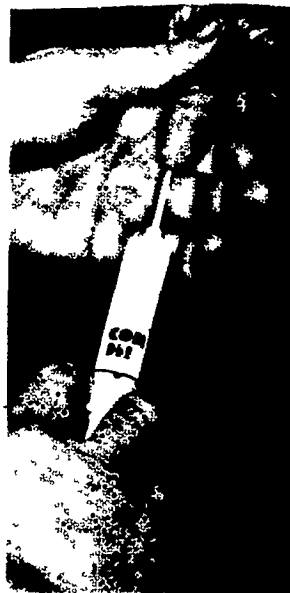
Wayne Dry Cow is an udder injection with special potency. Use it four weeks or more before freshening to help insure a sound start toward production.