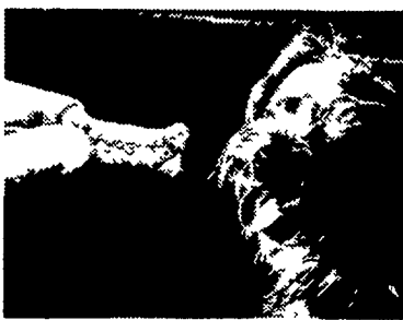
Doggie biscuit for the pup

And any banking service you'll ever need — always with a smile