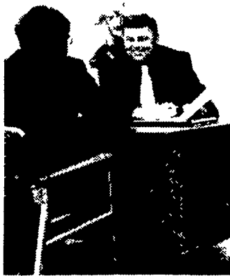
Aids with your financial needs