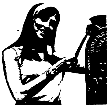
Lets you bank by mail