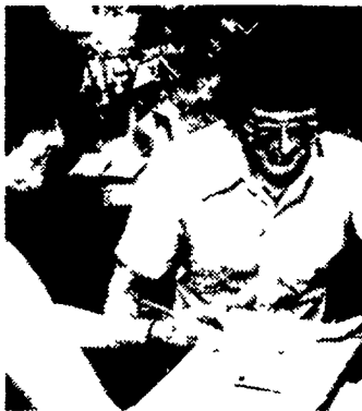
Has no-service-charge checking