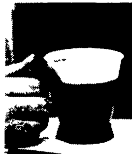
Always free coffee