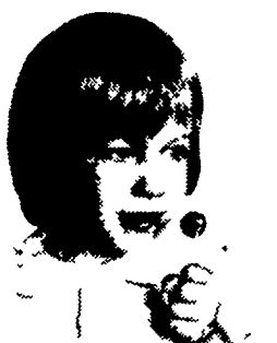
Lollipops to the kids