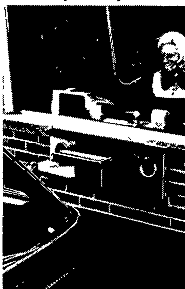
Helps you save