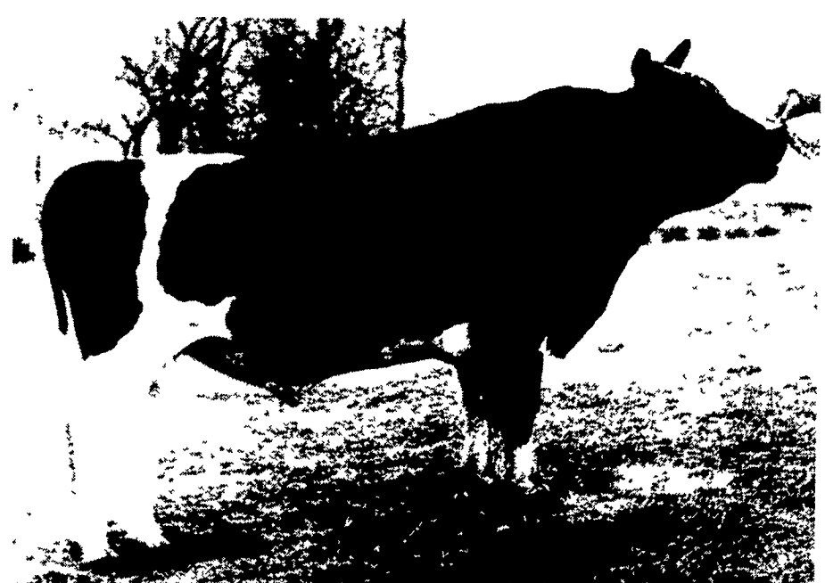
15H165 Producer's Skylark COMET

His Sire Osborndale Ivanhoe EX & GM 12 868 Daus +392M +21F 3 847 Pr Cl + 156 PDT His Dam Diamond J Ivy Telstar EX 2 4y 365d 2X 24 610M 4 7% 1 150F (2nd in U.S. for fat) 3-7y 365d 2X 25 791M 4 3% 1 113F Daughter of Roybrook Telstar EX & Extra dam is EX (93) 4E & GM