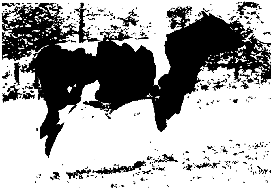
15H209 Sterk EXCLUSIVE

These Plus-Proven Sires Are Available Daily For Your Dairy Herd: