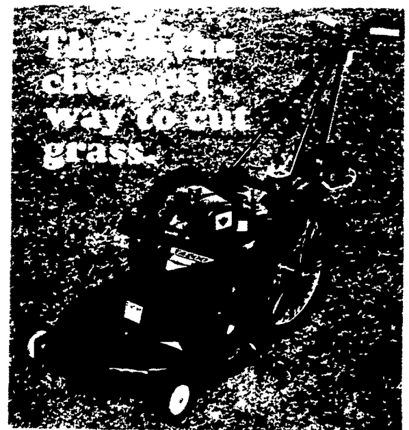
Figure it out. You can expect the average mower to last 3 to 4 years. That's the official industry figure. But the life expectancy of a Yazoo Big Wheel Mower is over 10 years. That includes the commercial users who work them Yazoo mowers 8 hours a day.

Helping people . . . that's the FARMERS FIRST way.