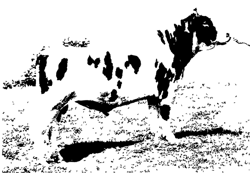
15H140 Round Oak ELECTRON Good Plus & Gold Medal; PQ & TQ [5/75]

These Plus-Proven Sires Are Available Daily For Your Dairy Herd: