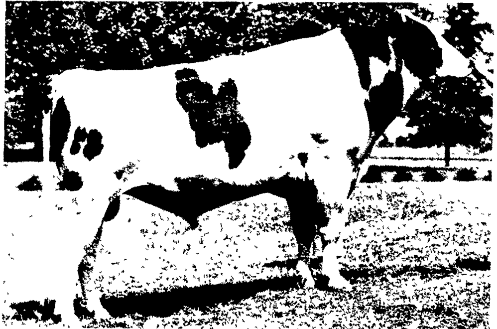
15H148 Penn-Octo KENNY Excellent [93] & Gold Medal; PQ & TQ [5/75]

USDA (May/75) - 304 Daus in 184 Herds Ave 14,846M 3.99% 593F Predicted Difference (92% rpt) +431M +$63 +50F Type 50 Classified Daus Ave 77 7, 46 Pr +.38 PDT Sire Lockway Sovereign Lucifer Lad - VG & GM Dam Round Oak Ivanhoe Emid - EX