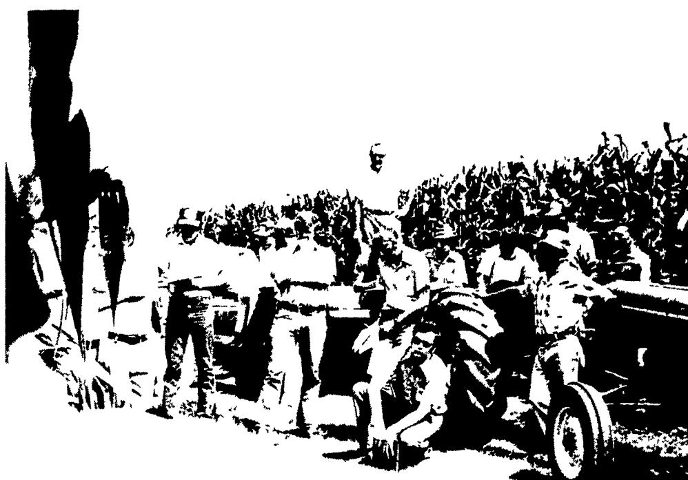
Farmers, chemical company representatives, and vo-ag instructors ponder results of planting corn in combination with crownvetch.

supposedly did best in sunny, hot, dry weather — which there was plenty of the day of the tour. In other field trials, weed control was studied after planting soybeans directly into barley stubble, right after the grain had been combined. Soybeans at the farm were big enough to warrant comment from a number of chemical company representatives who tour such facilities in several states. Many of the thick, bushy rows of beans were well over three feet tall and displayed a rich, dark green color. A spokesman for the reserach farm commented that a yield of 80 bushels per acre could be realistically hoped for with "a littel bit of luck."