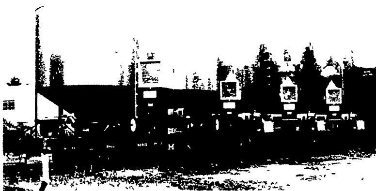
GT TOX-O-WIK CONTINUOUS RECIRCULATING GRAIN DRYERS

WORLD'S LARGEST SELLING RECIRCULATING BATCH GRAIN DRYERS BECAUSE