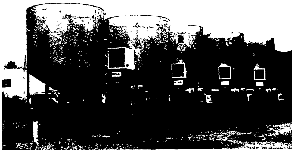
GT TOX-O-WIK® CONTINUOUS RECIRCULATING GRAIN DRYERS

YOUR NO. 1 GRAIN DRYER ON THE MARKET FOR EFFICIENCY & QUALITY IT CAN'T BE BEAT