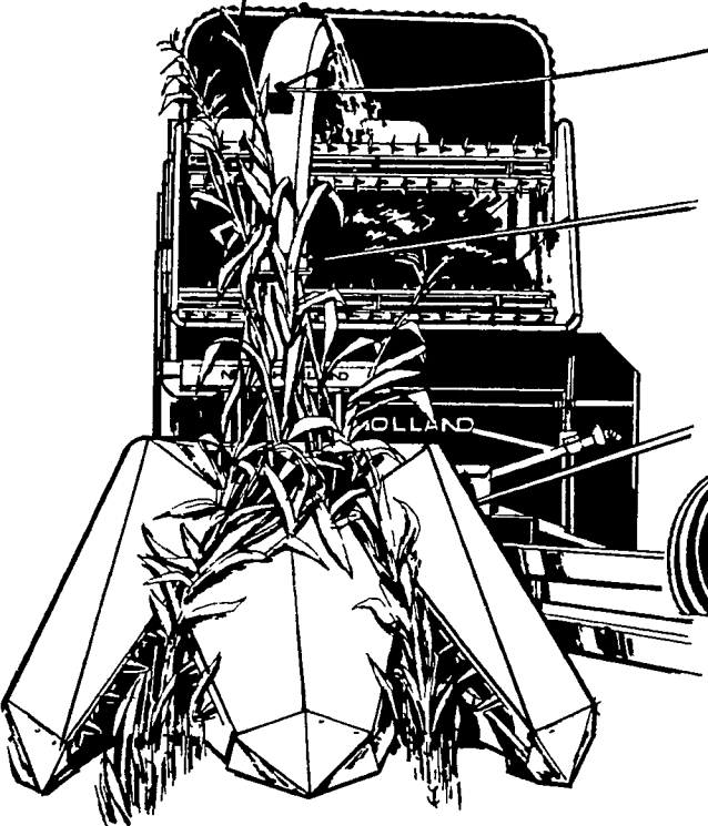
Super 717 Forage Harvester (Corn Head)