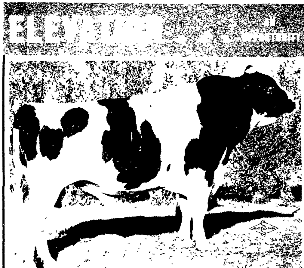
ROUND OAK RAG APPLE ELEVATION 1491007 Excellent (95) Gold Medal

Nelson Ebersole 867-4190 Fisher Real Estate 838-1316