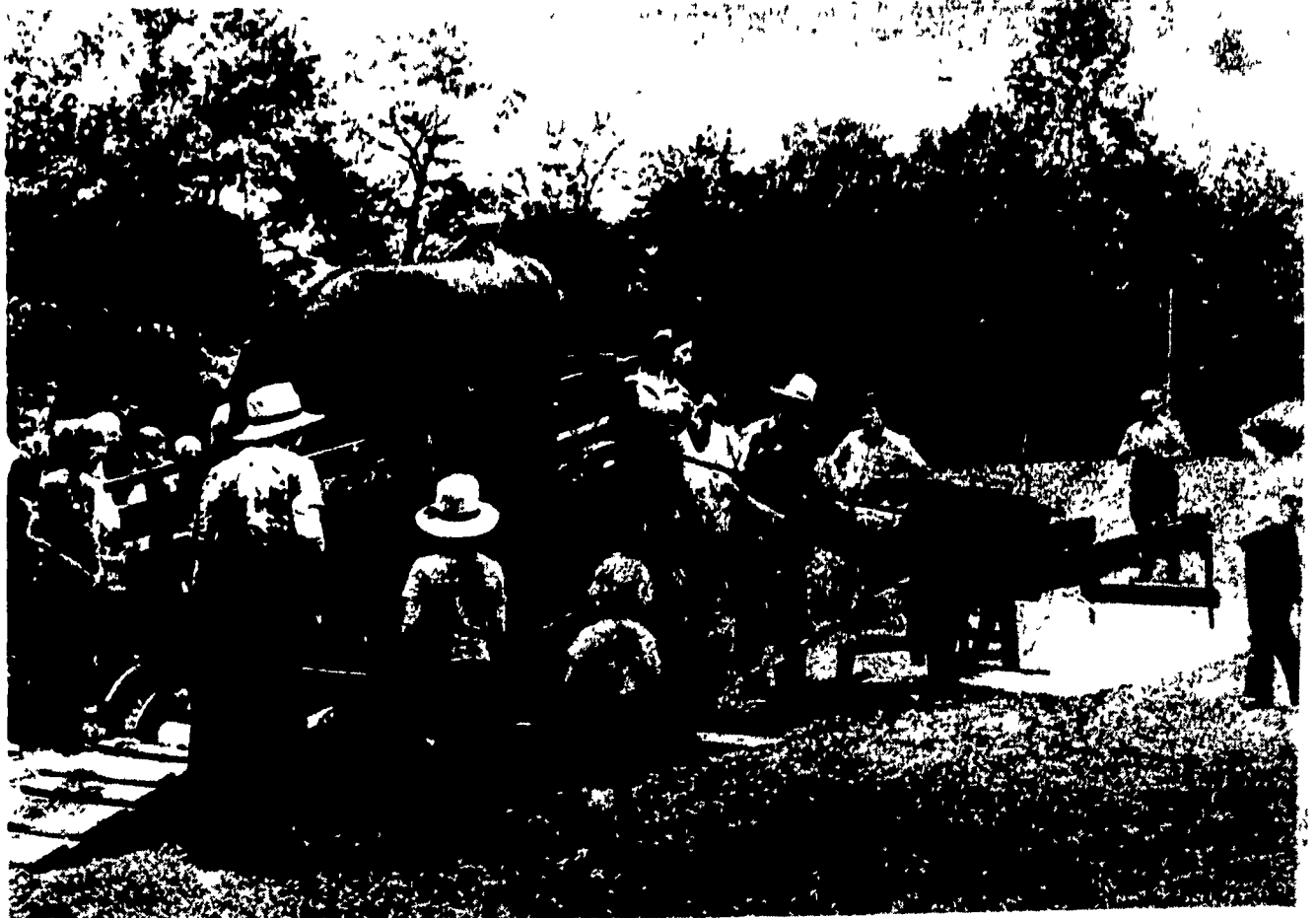
This horse-powered tread mill, manufactured by Heebner's of Lansdale, will be demonstrated at the

14. Points will be totaled for each exhibitor and prizes will be awarded as follows: Highest Total Points - $10.00, Second Highest Total Points - 7.00, Third Highest Total Points - 5.00, Fourth Highest