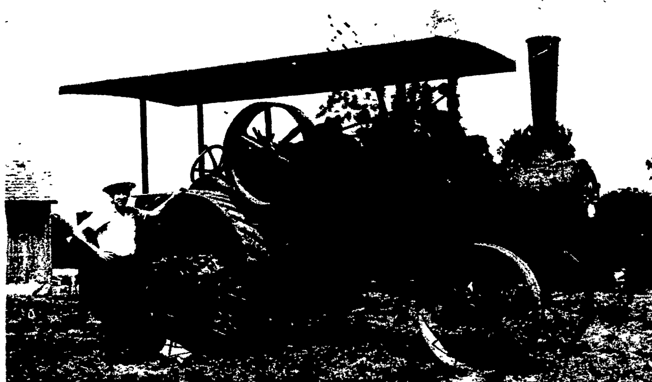
Samuel Kriebel, Mainland, Pa., stands beside a 1917 Case steam traction engine which he will exhibit at the Keystone Grange Fair, Trappe, Pa., on

August 2. The 40 horsepower giants were used for belt power to run various machinery in the past.