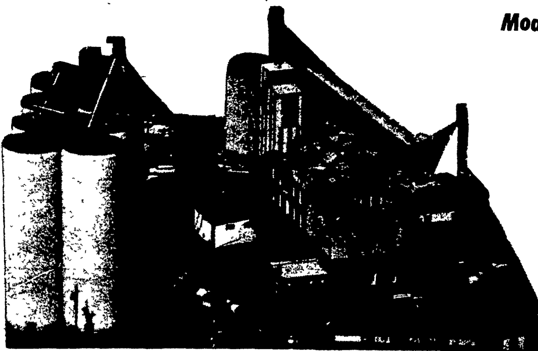
Grain Elevator, Feed Warehouse & Flour Mill, Fleetwood, Pa. (6 miles Northeast of Reading off Route 222)