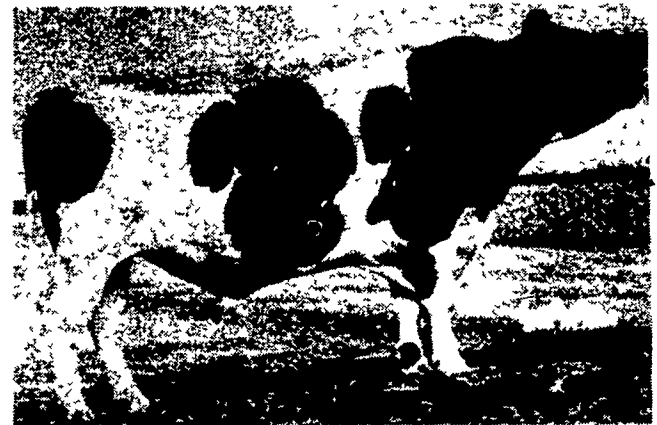
29 H2465 Sevens GRAND SUPREME VG87

USDA 5/75 RIP 14% Rpt 59% 29D 25H 17 624M 3 34% 588BF PD +$115 +1 74M- 22% +28BF