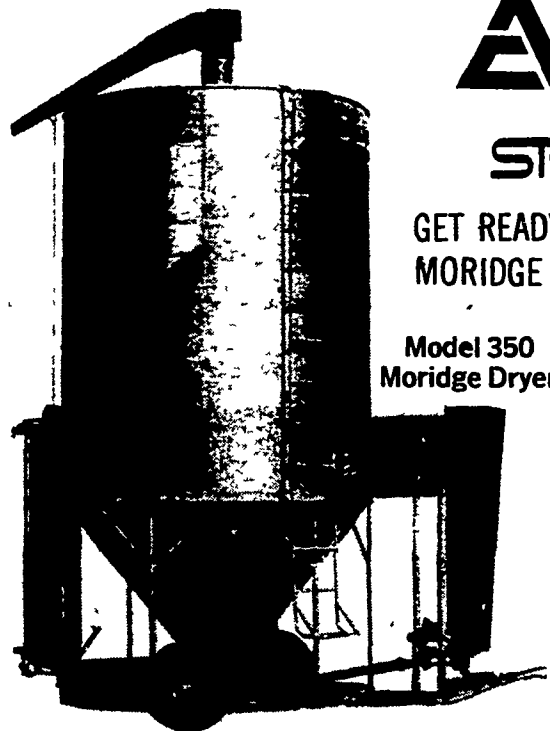
Model 350 Moridge Dryer

GET READY FOR THE GRAIN SEASON MORIDGE GRAIN DRYERS IN STOCK