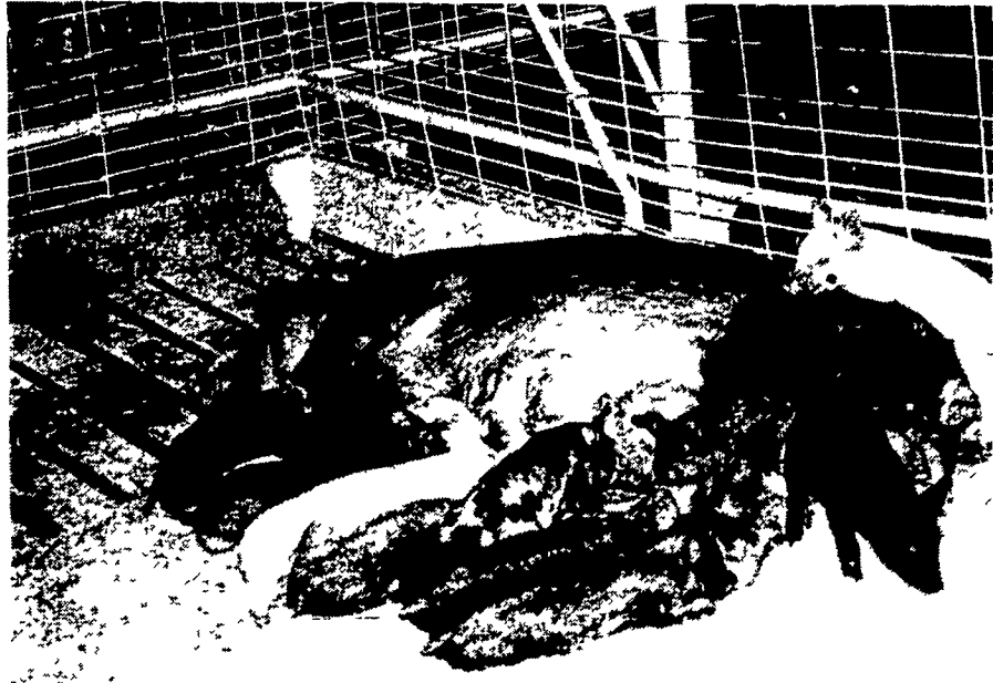
At the Rutt farm, young pigs are kept with the sows in block pens until being moved to finishing areas. Two