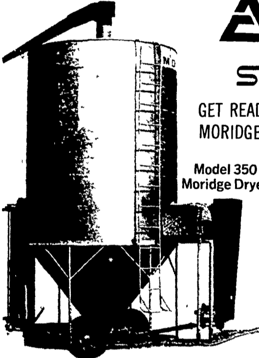
Model 350 Moridge Dryer

602 Main Street, Bally, Pa. 215-845-2261