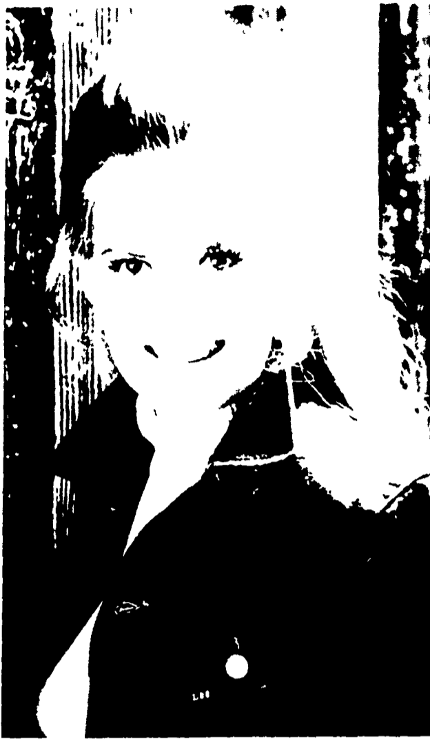
Lynn Anderson, well known in the music business for her hit, "Rose Garden" will highlight the July 5 Show at Cripple Creek.