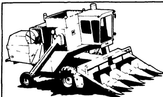
715 Combine w/13 ft. platform 4 row corn head, diesel w/cab