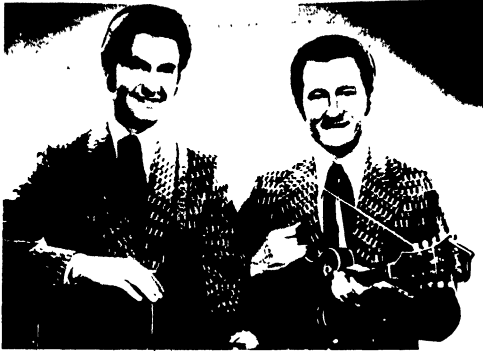
Jim and Jesse, country-western music recording stars from the Grand Ole Opry, will be the featured entertainers at the Shindig at Cripple Creek on June 21.

After joining the Opry, Jim and Jesse won acclaim with the larger national country music audience, towards which bluegrass fans often hold some degree of hostility. Jim and Jesse have bridged the gap successfully, however. While sometimes using electric backup instruments (guitar, pedal steel, bass) as tastes and acoustics require before a live country music audience or in their syndicated television show, they have continued to be favorites of the bluegrass crowds, appearing with straight bluegrass accompaniment at festivals and concerts.