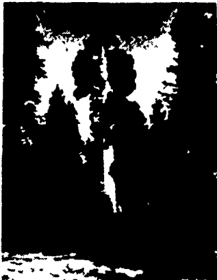
ANCIENT ONE General Grant Tree, situated in the Grant Grove section of Sequoia and Kings Canyon National Parks, is more than 3,000 years old, stands more than 267 feet high, and is estimated to weigh more than 1 1 tons.