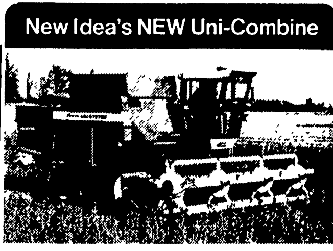
New Idea's NEW Uni-Combine