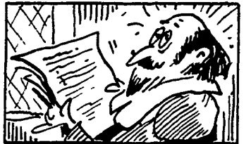
Bowlerize is derived from Thomas Bowdler, and English editor of strict morals, who attempted to improve Shakespeare by removing all "improper" reference.

BULLS: Yield grade 1-2 1100-1800 lbs. 22.00-26.00; few 1 1800-1950 lbs. 28.00-29.00, individual 32.00.