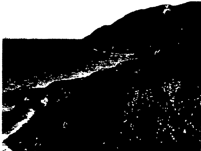
SCENIC TRAIL. Nova Scotia's Cabot Trail winds around the highlands of Cape Breton. Popular with tourists the island's summer activities include swimming, boating, fishing, diving, visits to historic sites and other special events