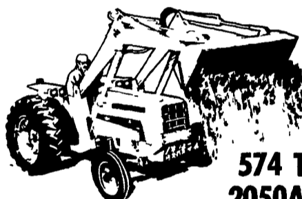
574 TRACTOR 2050A LOADER