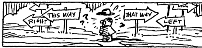
It is possible to go wrong in many ways, but right in only one. The former is thus easy and the latter difficult.