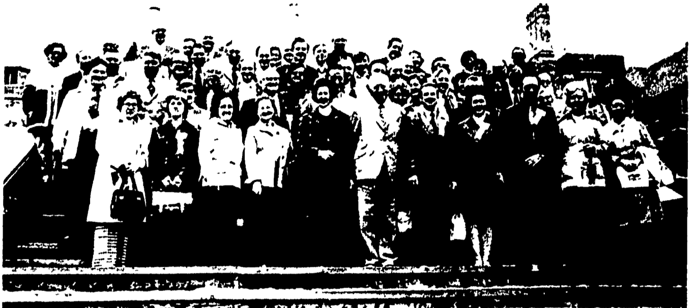
Ayrshire cattle breeders and their wives from Ireland, Scotland, Wales and England joined with local cattlemen to tour the Masonic Home's Ayrshire herd on Monday morning (May 5). The tour