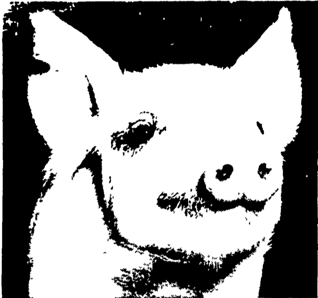
This 7-day-old pig's stomach is exactly this size