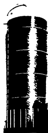
Oxygen Limited Glass Lined Steel Cropstore

★ Easy to Operate ★ Durable and Dependable