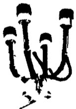
The Sta-Rite Full View Milker permits a constant visual check of milk flow. Cuts milking time, reduces over milking.

Modern Sta-Rite dairy equipment makes every milking system better, more efficient, easier on you and your cows. And you can add any of these up-to-date products to your stanchion barn or milking parlor.