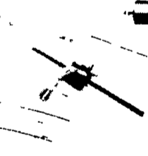
The new Sta-Rite Vac-Sav Milk Valve reduces vacuum loss to a minimum. Also gives protection against contamination.