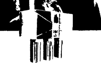
Milk pipeline washing completely automatic and Grade A clean with a Sta-Rite Full Convenience Pipeline Washer. A 24-hour timer lets you pre-program all necessary wash, rinse and sanitize cycles with fail safe protection.

Sta-Rite . . . a leader in dairy equipment. Whatever the size of your herd, Sta-Rite has the complete automated milking system for you. Sta-Rite Stanchion Barn, Full Comfort Parlor, Full Circle, and Reflex Arm Milking Systems will help you milk better, faster and more profitably.