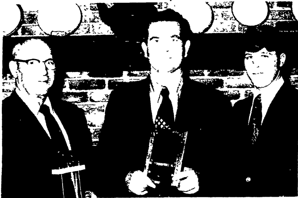
Lebanon and Berks County dairymen honored on Tuesday for outstanding herds and/or individual cow records at Pennfield's Annual