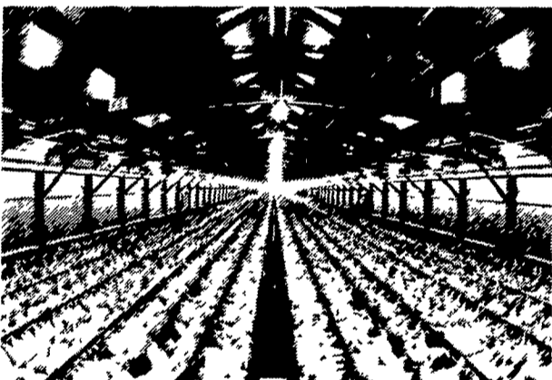
Technical, practical knowhow extending from poultry housing complexes to complete crop programs.