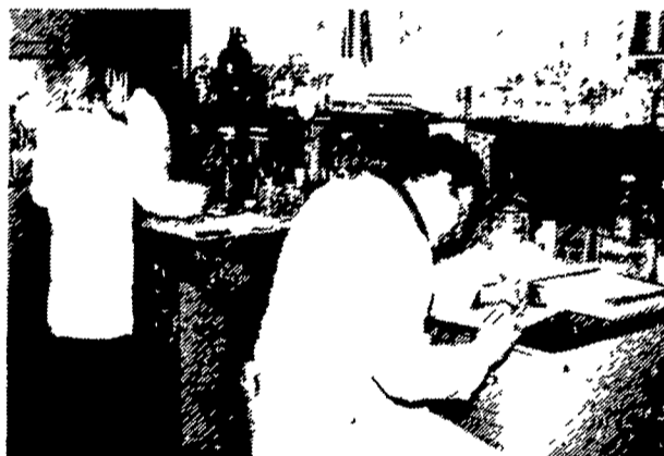
A consistent control program at each mill for assurance of continuing feed quality, freshness and consistency