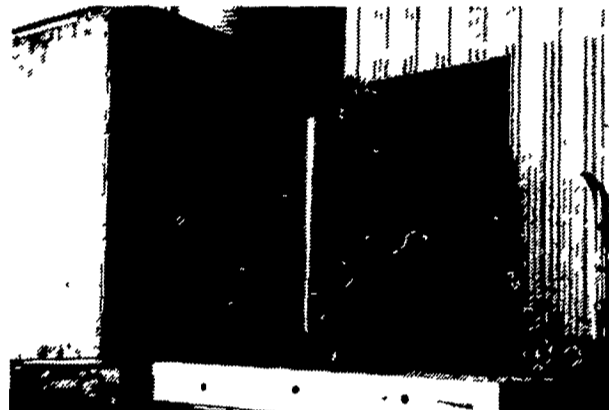
An egg marketing program that really helps Agway members—a good dependable program