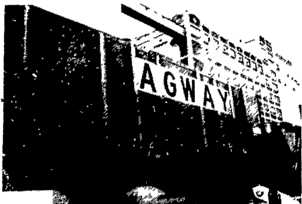
Quality ingredients bought in massive volume to help maintain competitive prices on all rations