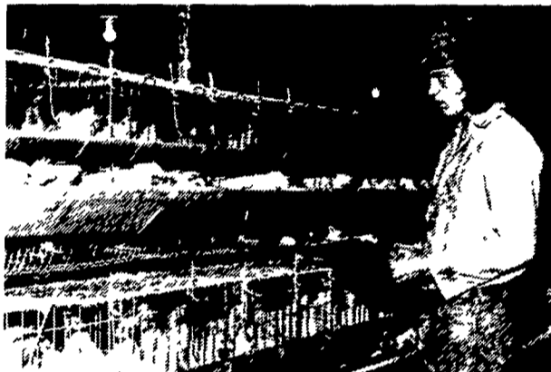
New feeding and management ideas from studies conducted on the several Agway Poultry Research program farms.