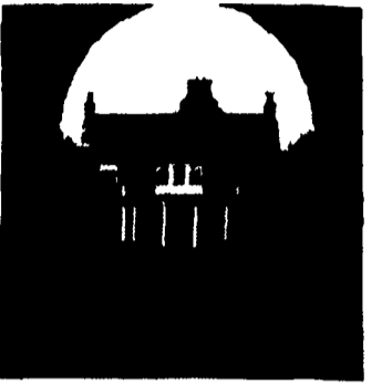
HISTORIC The Stone House at the National Institutes of Health, Bethesda, Maryland, houses scientists from all over the world who are visiting the institution. Many Nobel laureates have stayed here.