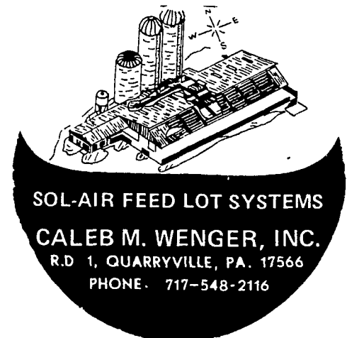
SOL-AIR FEED LOT SYSTEMS CALEB M. WENGER, INC. R.D. 1, QUARRYVILLE, PA. 17566 PHONE: 717-548-2116

Depending on the VanDale unit you buy, you can save up to $200 on your purchase. These price roll-backs apply only to VanDale products bought and paid for from a participating distributor during the month of March, 1975.