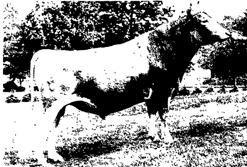
15G106 Edisto Farms FAVORITE'S Bonus

USDA (Nov /74) — 34 Daus in 6 Herds Ave 10.837M 4 79% 519F Predicted Difference (45% rpt) +917M +$77 +34F Type 17 Classified Daus Ave 83.4, + 3/Br Ave Sire Superb Adonis EX Dam Ann Arbor Sables Ginger — VG