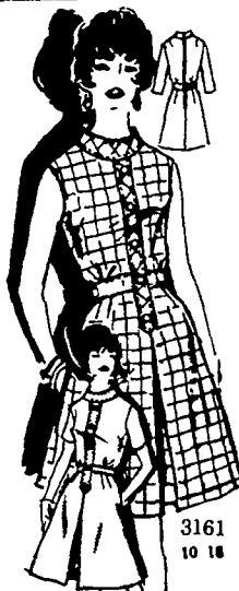
Brisk Style for a Washable

Stand up collar and front band that stitches on, trim this dress which zips down the back. No 3161 comes in sizes 10 to 18. Size 12 (bust 34) without the sleeve takes 2½ yd of