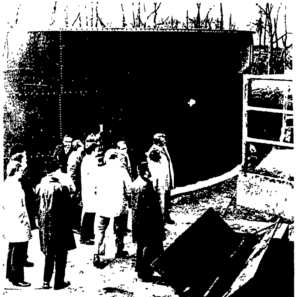
A group of bankers looks over the Slurry Store installation on the Myers Brothers farm in Penn Township, Lancaster County, during a special tour for bankers on Thursday afternoon. The installation, erected by A. O. Smith Harvestore, is the first of its kind in the East.