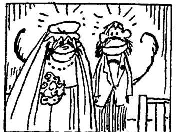
In India, ape weddings are occasionally performed by the clergy.

HEIFERS: Early, high-choice and prime 972-1100 lbs. yield grade 3-4 34.50-35.00 at midweek choice 825-