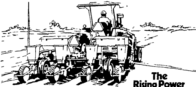
The Rising Power in Farming

The new Allis-Chalmers Air Planter has a seed drop of just 5". Closer than any other on the market today. What does this do for you? Well, the shorter the drop the less chance there is for each seed to miss its target. Which also means more uniform spacing. And there's more Choice of unit drive or common drive. Winkin Blinkin Monitoring Systems. Electric motors that give you two-for-one savings. Ask your Allis-Chalmers dealer for more down-to-earth facts.