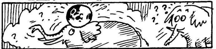
Indians believed that the world rests on the head of an elephant, whose movements cause earthquakes!

Members from Berks Legislative committee will be visiting their Congressmen and Senators in Washington on March 12 and 13 and the State Assemblymen at Harrisburg on April 7.