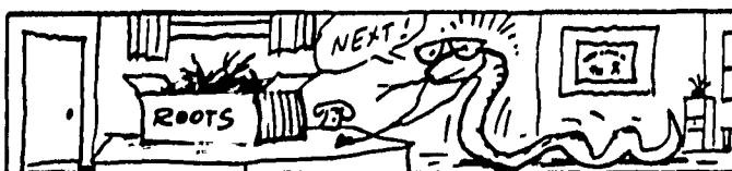
It was once believed that serpents cured blindness with fennel roots