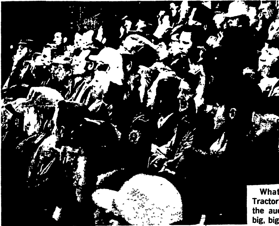
What're they all looking at? Tractors - 171 in all - that went under the auctioneer's gavel at Wenger's big, big, big 1975 winter sale.