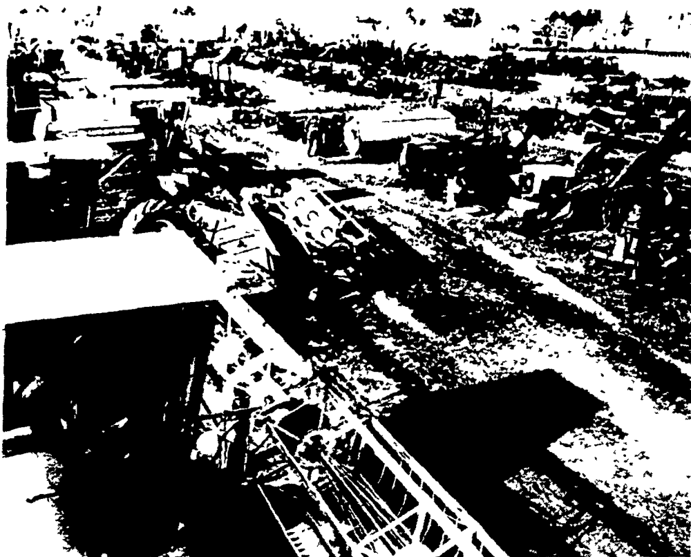
Acres and acres of farm equipment, some $1.3 million worth, was set out before prospective buyers' eyes this