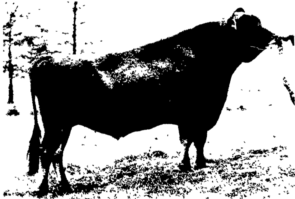
15J48 B.S Noble SUPERB - Gold Medal

These Plus-Proven Sires Are Available Daily For Your Dairy Herd: