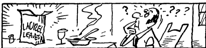
People occasionally remember to believe that laurel leaves can cause forgetfulness.

Coffee was first discovered in Ethiopia in the middle of the ninth century. Legend has it that a goatherd saw his goats acting very frisky, so he joined them in eating the berries of wild coffee trees and felt frisky as well.