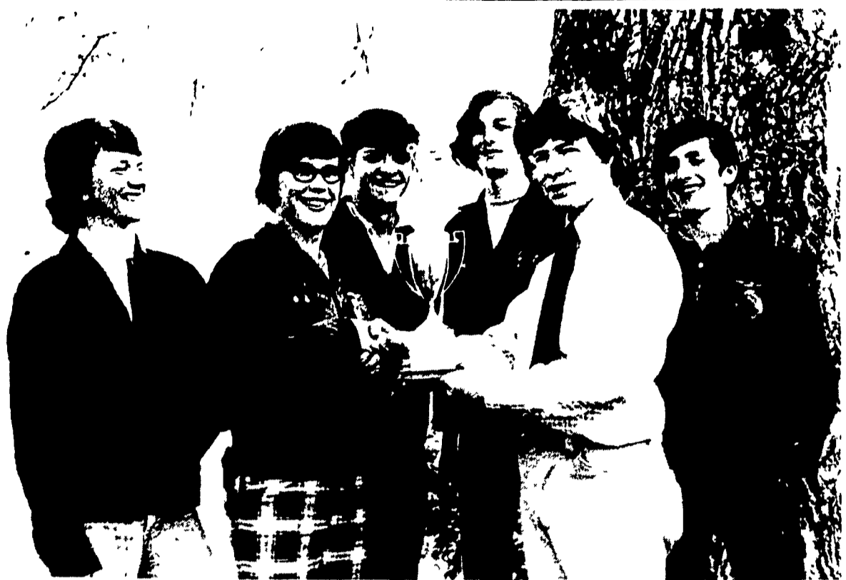
May 18 - The top team in the 1974 Lancaster County FFA Land Judging Contest was from Solanco High School. The smiling victors were shown here as they received their winning trophy