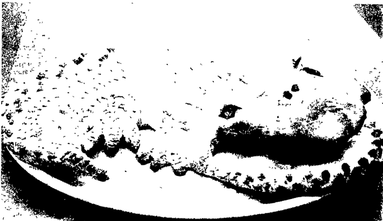
February 23 - This feisty looking critter starred in a Sally Bair feature story on the baking class at the Willow Street vo-teach school.