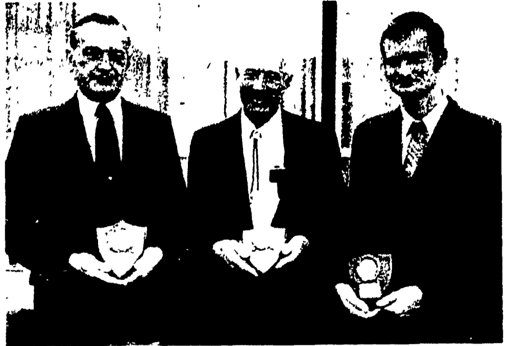
Three of Lancaster County's leading DHIA milk producers were photographed after the annual Red Rose DHIA banquet at the Farm and Home Center on Thursday afternoon.