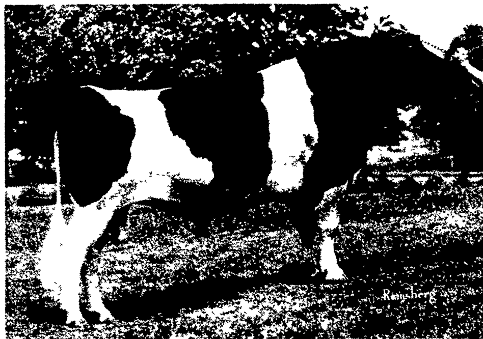
15H128 WINTERthru Hector Ivanhoe Van Very Good [88] & Production Qualified [5/74]

These Plus-Proven Sires Are Available Daily For Your Dairy Herd: