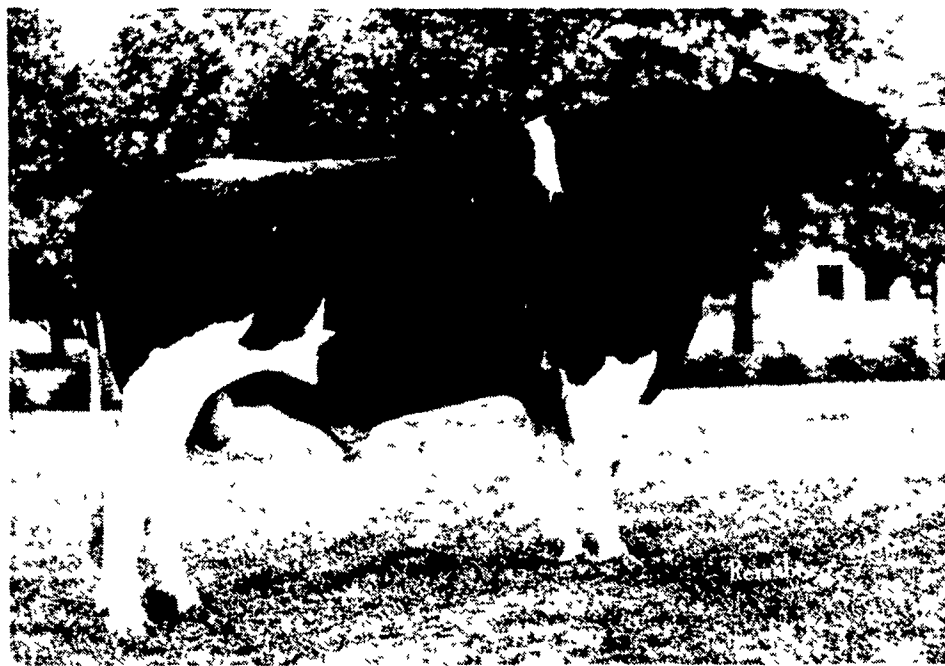
15H171 Minnechaug Glenafton HERCULES Very Good [88] & Gold Medal; PQ & TQ [5/74]

USDA (May/74) -- 86 Daus. in 62 Herds Ave. 15,748M 3.77% 593F Predicted Difference (79% rpt.) +889M +$74 +45F Type -- 17 Classified Daughters Ave. 79.5 (act.); 11 Prs. -.39 PDT Sire: Northmoor Leader Hector -- GP & PQ Dam: Winterthur Ivanhoe Jaunty Paca -- VG (88)