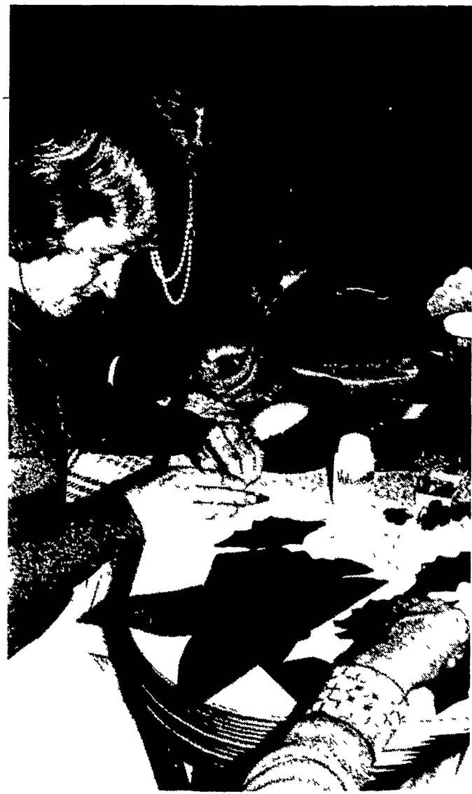
Members of Farm Women Society 22 use Holly to dress up the styrofoam dolls.

Any of these items can help make the holiday season bright at your home - but get an early start so you can complete them at leisure.